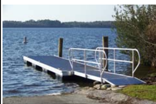
Floating Dock at High Point

Bayou George Little League and Hiland Park Little League's opening day was March 14th. Southport Little League's opening day was March 21st. Opening day at the parks was filled with excitement, good food, and a