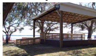
New stage at Under the Oaks

Spring is off to a busy start in Parks & Recreation. Staff completed the Under the Oaks stage project and renovations at the Spring Avenue Park.